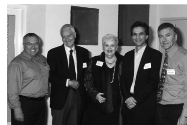
Above: Snapshots from the opening of the WA Chapter's newly purchased, heritage-listed premises at Nedlands.

the "Which Way?" conference. At its November meeting the National Council endorsed two new policies on Heritage Conservation and Universal Access, which are now available online. In the schedule of new policies to be presented at every National Council meeting, Sustainability and OH&S are planned for March 2008.