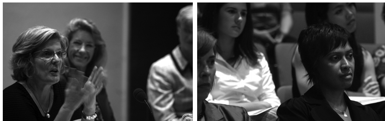
Snapshots from the inaugural NSW State Forum that kick-started the RAI A-supported Constructive Mentoring Programme.

The programme was designed to be run from NSW and is administered by an independent company, Orijen, who have provided mentoring in corporate environments for 25 years. Orijen takes direction from a steering committee comprising NAWIC, MBA and RAI A representatives. For more information, log on to www.orijen.com.au/constructive_mentoring/ .