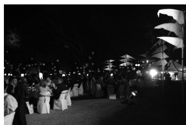
Above: Snapshots from the 2007 National Architecture Awards held in Alice Springs, NT.